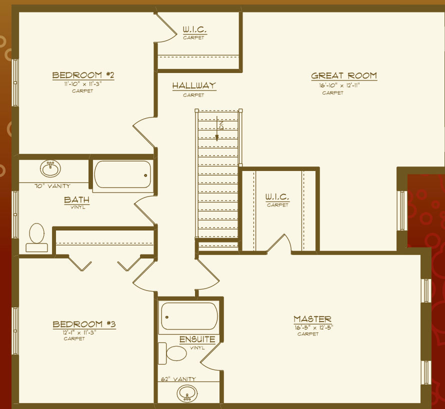
Upper Floor 1,200 Sq. Ft.

All drawings are artist concepts of the final product and may be revised and/or improved as necessitated by Architectural controls. All floor plans are approximate dimensions. Floor areas shown include "open to below" but do not include garage or basement areas. E. & O. E.